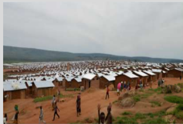
Mahama Refugee Camp(ww.PMVI.gov)